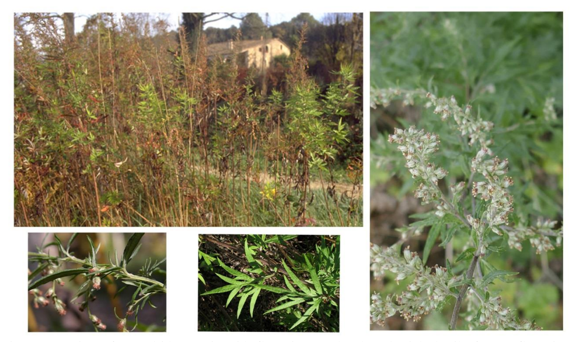
Fig. 1. Overview of a roadside margin with flowering sagebrush and mink detail of some flowering branches (inflorescences in capitulum and leaves) and leaves.

It is found on roads and roadsides, riverbanks, uncultivated and poor soils, and even on saline and lowland soils in the high mountains.