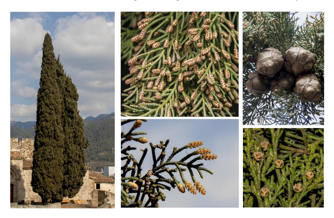
Fig. 1. General view of a cityscape with cypress trees and detail views (middle) of branches ending in male inflorescences and (top right) of galbulus (fruits) and (bottom right) branches ending in female inflorescences.

They are found planted in squares, parks and gardens and are common in cemeteries and as "fences" on roads and barriers to protect crops from the wind in the countryside.